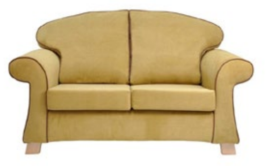
Charles h 970 w 1560 d 870 sh 450