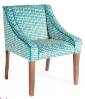
Roberto h 850 w 650 d 680 sh 490