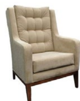
Hugo h 1120 w 750 d 760 sh 470