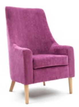
Rose h 1070 w 710 d 700 sh 490