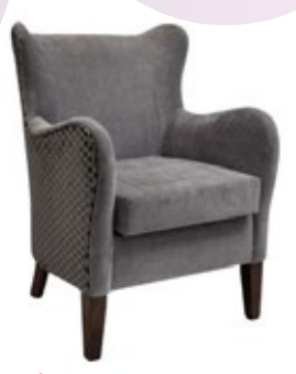
Monica h 970 w 690 d 740 sh 490