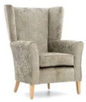
May High Back h 1060 w 780 d 750 sh 490