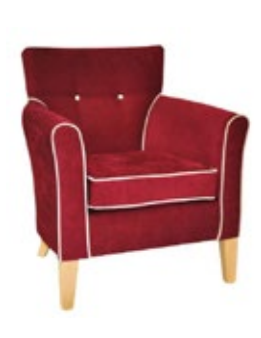
Carter h 870 w 790 d 780 sh 480