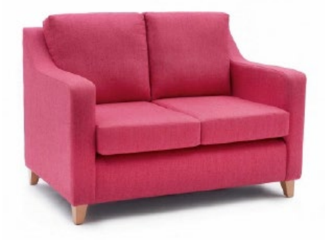
Strauss h 970 w 1780 d 900 sh 500