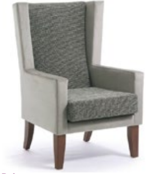
Dalton h 1085 w 715 d 800 sh 460