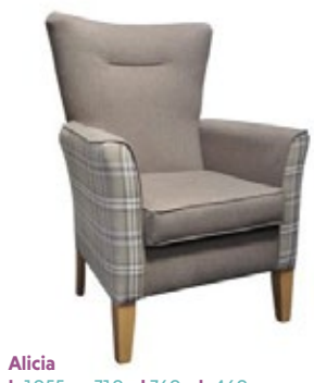
h 1055 w 710 d 760 sh 460