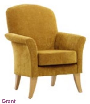
h 970 w 740 d 820 sh 460