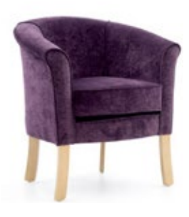
Daisy h 800 w 760 d 640 sh 510