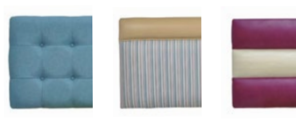
Zander h 550 w 930