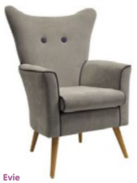
h 1100 w 870 d 840 sh 460