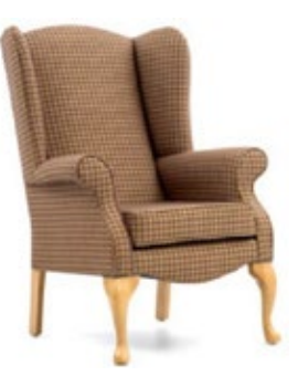
Farrah h 1040 w 740 d 790 sh 460