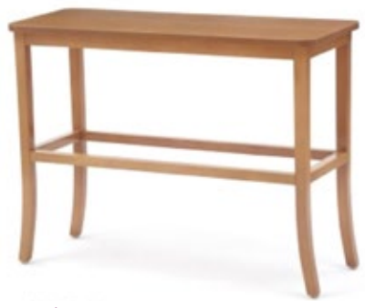
Side Table HPL h 750 w 1000 d 400

Images show the style only as any item is available in any fabric and colour of your choice.