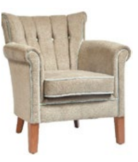
Camari MB h 950 w 860 d 840 sh 490