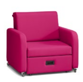
Chloe h 864 w 686 d 838 sh 406