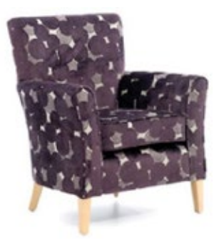
Parker h 910 w 780 d 730 sh 490