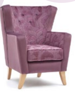
Lana h 970 w 810 d 850 sh 480