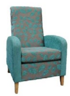
Morwen h 1090 w 680 d 770 sh 490