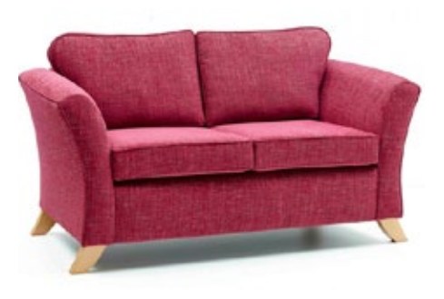
Molly h 910 w 1530 d 880 sh 500