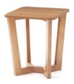
Newby Square h 550 w 450 d 450 h 550 w 600 d 600