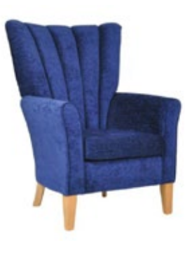
Carly h 1080 w 810 d 840 sh 460