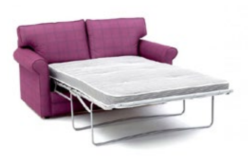
Juliette h 920 w 1660 d 910 sh 430