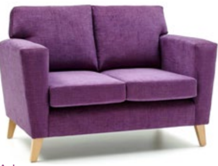
Arden h 910 w 1530 d 880 sh 500