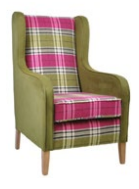
Blake h 1110 w 670 d 760 sh 500