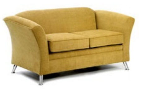
Morgan h 790 w 1570 d 810 sh 510